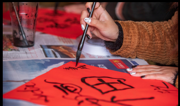
Workshop in Chinese Writing at Culture Liverpool's Chinese New Year Celebrations