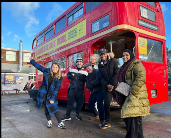
Writers Directory and The Writing Bus

Reach of 4.5m across the year on Culture Liverpool and Year of Writing Social Media platforms.