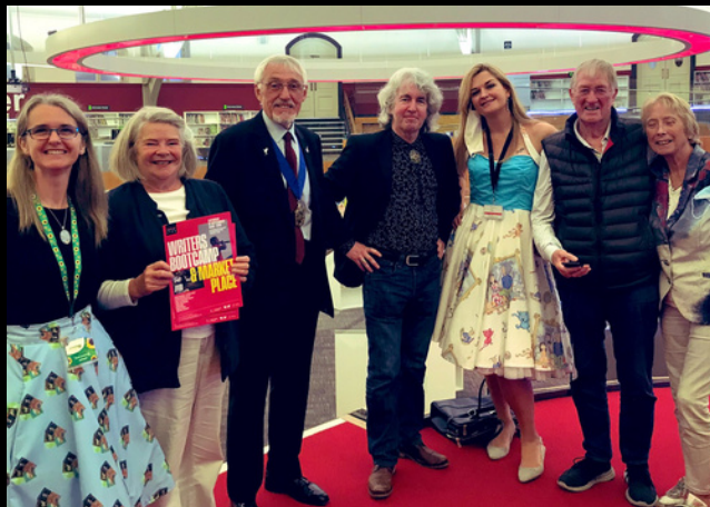
Some of the core team members at Liverpool Central Library