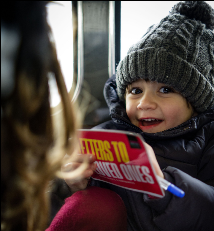
Young child enjoys taking part in Year of Writing Community Activities on the Writing Bus