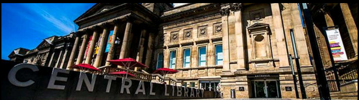
Liverpool Central Library